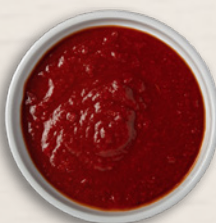
RED CHILE PUREE (GREEN CHILE OPTION)