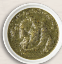
FIRE ROASTED GREEN CRUSHED