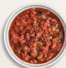
FIRE ROASTED SALSA