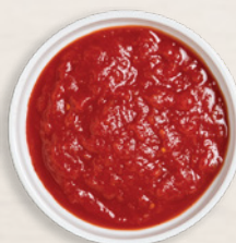
GROUND IN PUREE