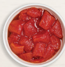
DICED IN JUICE