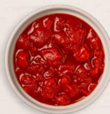
DICED IN JUICE WITH CONCENTRATED TOMATO