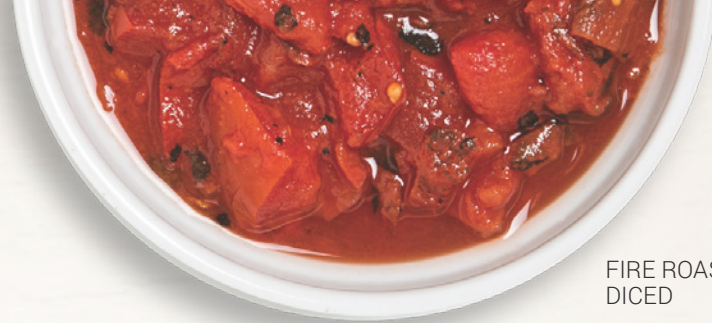
FIRE ROASTED DICED