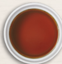
FILTERED TOMATO CONCENTRATE (AGED OPTION)