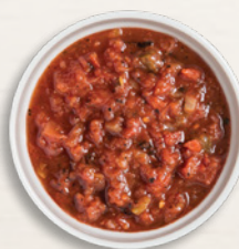
FIRE ROASTED SALSA