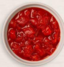
DICED IN JUICE WITH CONCENTRATED TOMATO