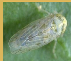
Sugar Beet Leaf Hopper

Beet Curly Top Virus is a member of the geminivirus family. It can only be vectored from plant to plant by the Sugar Beet Leaf Hopper. The tiny insect winters in the foothills and migrates to farmland as the vegetation dries up. Although leaf hoppers don't feed on tomato plants, they do taste the leaves. Once bitten by an infected Sugar Beet Leaf Hopper, the plant typically shows symptoms after 14 days, then dies.